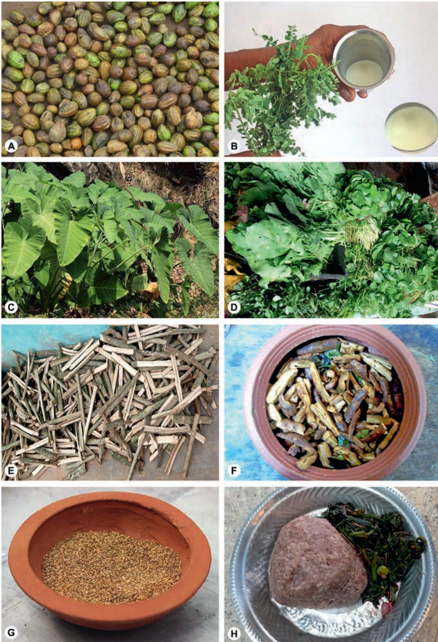
Fig. 2. Medicinal and food practices by Irula community; A. Drying process of Terminalia chebula fruits for traditional uses; B. Phyllanthus niruri L. with goat milk used for jaundice and high fever; C. Colocasia esculenta (L.) Schott; D. Cultivated leafy vegetables Centella asiatica (L.) Urb., Amaranthus spinosus L., Basella alba L.; E. Dried stems of Lantana camara L. for burning incense; F. Pickle made with Decalepis hamiltonii Wight & Arn. tubers; G. Millet – Panicum sumatrense Roth; H. Traditional food, ragi ball Eleusine coracana with stir-fried Amaranthus spinosus