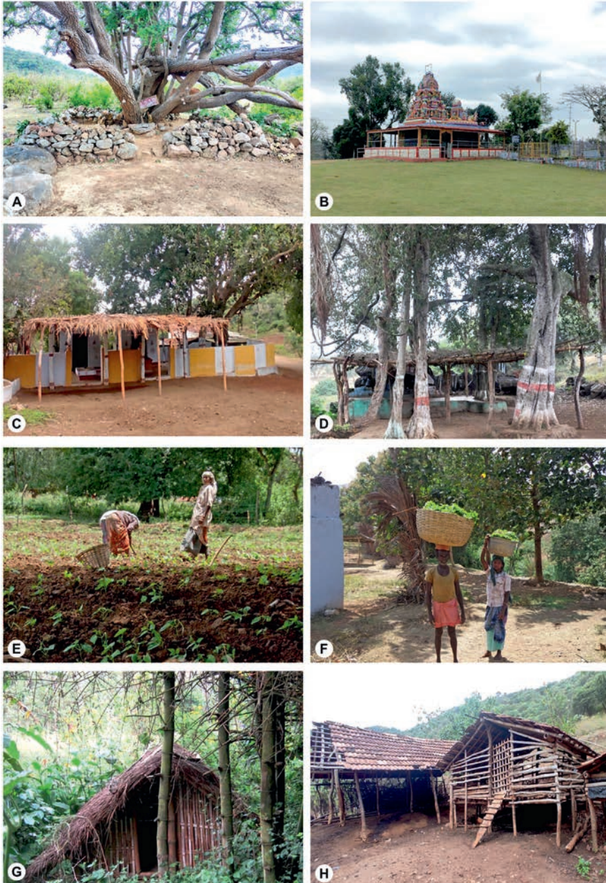
Fig. 1. Livelihood of Irulas from Nilgiris and Coimbatore districts of Tamil Nadu; A–D. Temple and sacred grooves; E–F. Agriculture practices of Vigna radiata (L.) R. Wilczek and harvested leaves of Coriandrum sativum L.; G. Abandoned bamboo hut used for goats; H. Building material Bambusa bambos (L.) Voss and Areca catechu L. used for cattle shed