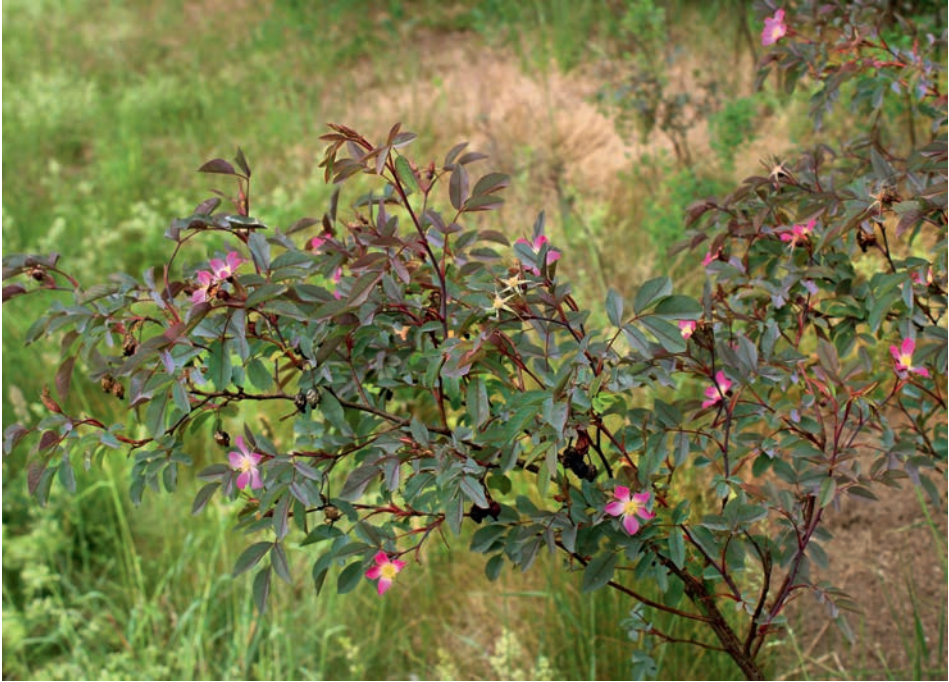
Fig. 3. Red-leaved rose Rosa glauca Pourr. (Photo. W. Gruszcza, Motylewo village, 2022)