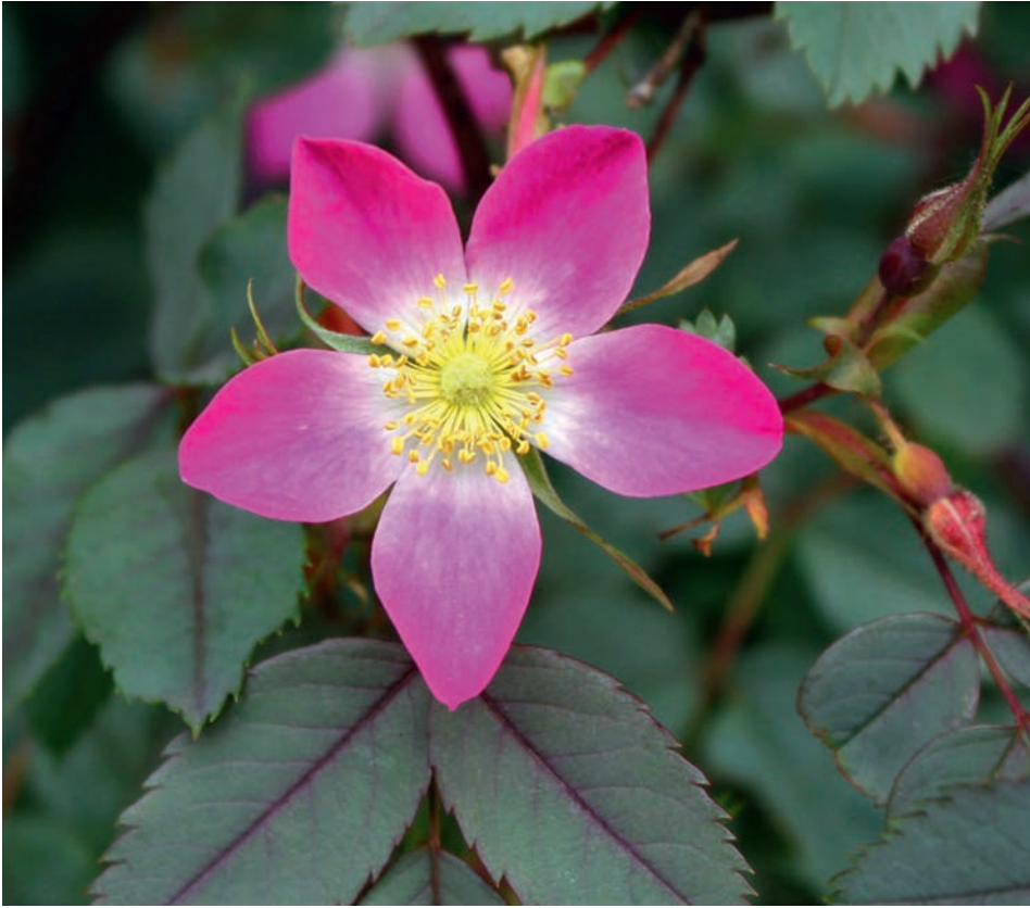
Fig. 1. Flower of red-leaved rose Rosa glauca Pourr. (Photo. W. Gruszkza, Motylewo village, 2022)

Petals are single, with color from deep pink to crimson-red, sometimes white basally, styles exsert 1–2 mm beyond stylar orifice (1.5–2 mm diameter) of hypanthial disc (3 mm diameter). Hypanthium is narrowly ovoid, glabrous, glandular or eglandular, neck purplish, sepals spreading, lanceolate, margins entire, and sometimes pinnatifid. Hips are dark brownish red to crimson red, globose, ovoid, or obovoid. Sepals deciduous as hips mature, erect to spreading (Popek, 2007; Lewis et al., 2014; Fig. 2). It is a tall shrub reaching 2–3 m in height, with erect purple-colored shoots, without or only with very short stolons (Seneta, Dolatowski, 2004; Fig. 3).